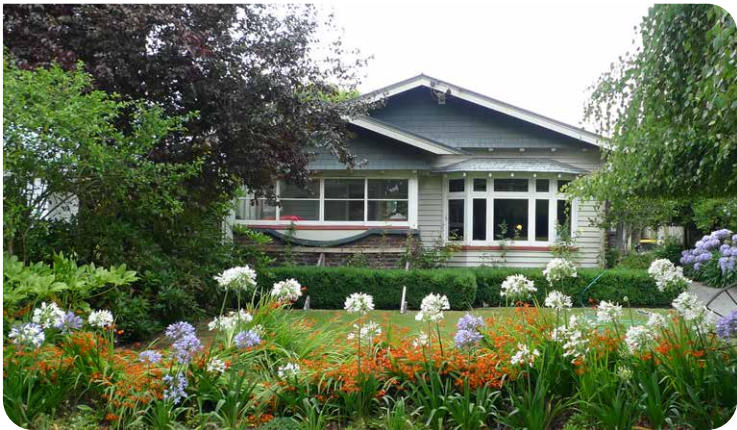
Example of a bungalow on Ranfurly Street