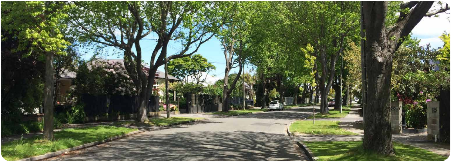
Ranfurly Street 'curve'