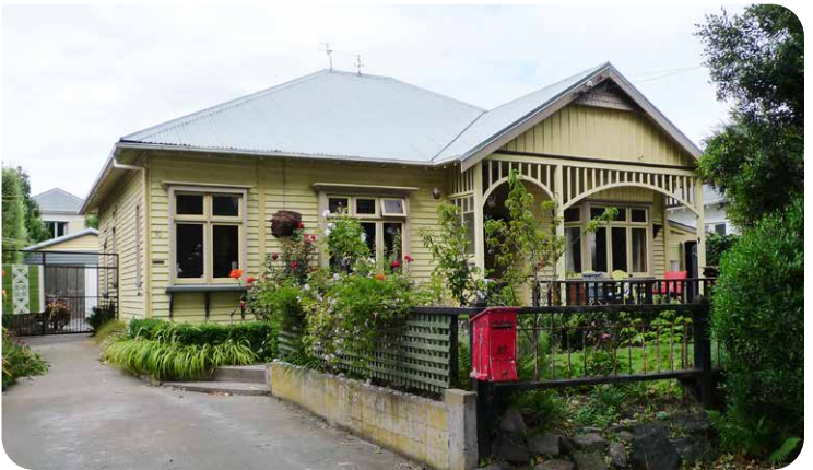
Example of a villa in Ranfurly Street