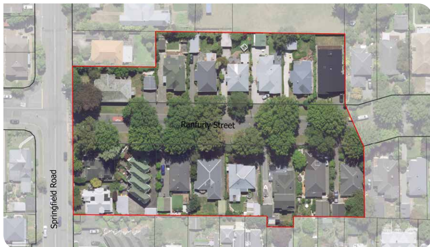
Map of Ranfurly Character Area – Operative 2 December 2024

* For further District Plan advice please contact Christchurch City Council on (03) 941 8999 and ask for a Duty Planner, or for design assistance ask for an Urban Designer.