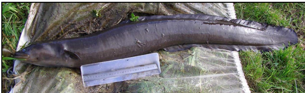
Figure 2: A large longfin eel caught in a Canterbury waterway. Longfin eels are an At Risk species in decline 2 .