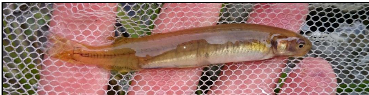
Figure 3: An adult inanga. Juvenile inanga are commonly known as whitebait. Inanga are classified as an At Risk species in decline 2 .